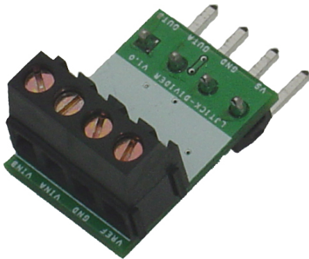
Figure 1: LJTick-Divider

Prior to December 2007, all shipped LJTick-Dividers were the UNI10V configuration and were not specifically labeled. Starting December 2007, all shipped LJTick-Dividers have a label specifying UNI10V, BIP10V, or other.