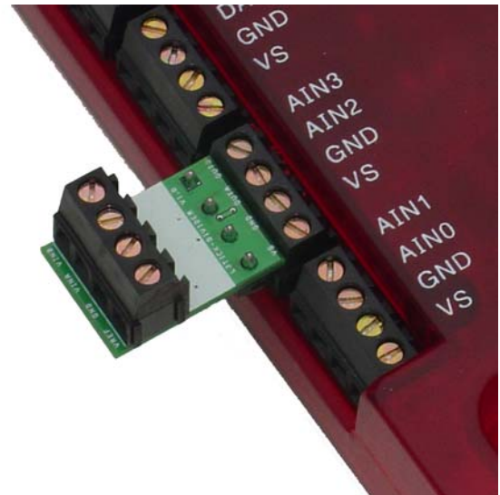
Figure 2: LJTick-Divider With UE9

VINA/VINB: These screw terminals are for the 2 single-ended channels of input analog voltages. With the factory default configurations (UNI10V or BIP10V), the input to either of these terminals is typically 0-10 or \pm 10 volts, and produces 0-2.5 volts on the respective OUT pin.